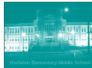
Hazleton Elementary Middle School