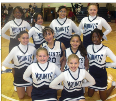
2009-2010 Mounts Cheerleaders

The squad cheers for the 2009-2010 girl's and boy's basketball teams. They may only cheer at basketball games,