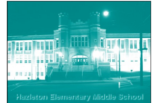
Hazleton Elementary Middle School