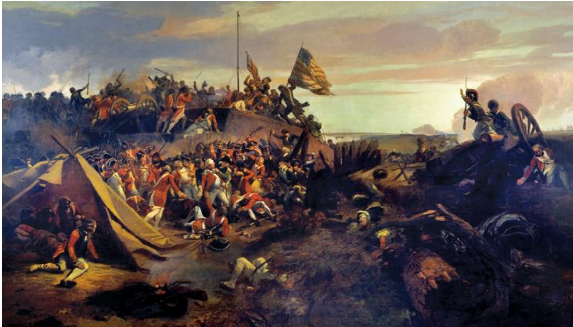
A 600-man assault column led by Colonel Alexander Hamilton captured key Redoubt No.10 in a night attack. The British surrendered soon after.